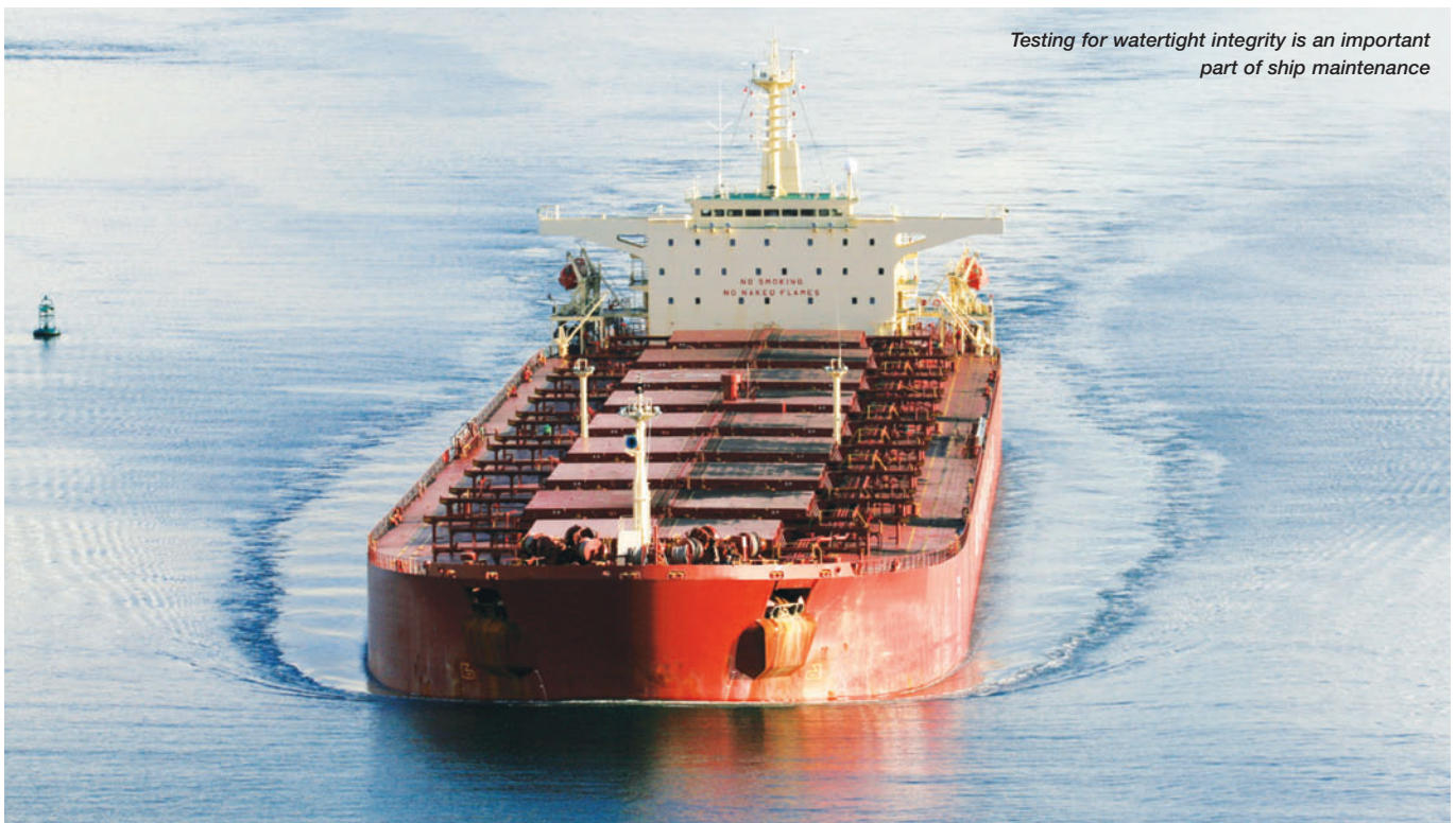
Testing for watertight integrity is an important part of ship maintenance